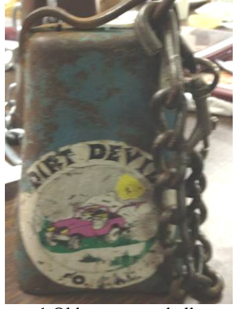
1 Old green cow bell.

Old Blue Mike Maneth Calico February 2012