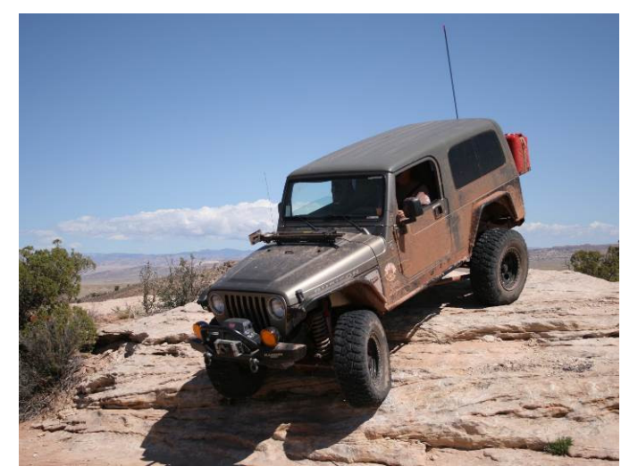
We lunched at one of the Gray Fox's favorite areas "The Gravy Bowl" The Gravy Bowl is a small bowl similar to

Once entering Mashed Potato it is obvious how this area got its name: it is all white sandstone mounds. The trail winds around a few good bumps and ledges. The ledges range from 6 to 10+ feet. If you haven't learned the Moab bump before now, you're going to get a crash course at Mashed Potato. The trail is a ledge climb then down the back and right up the next ledge. Believe me, this trail was a lot of fun but you better keep focus. Getting a little off line would sometimes mean you don't make it and have to go around. Danny and Pete launched off one of these ledges catching air.