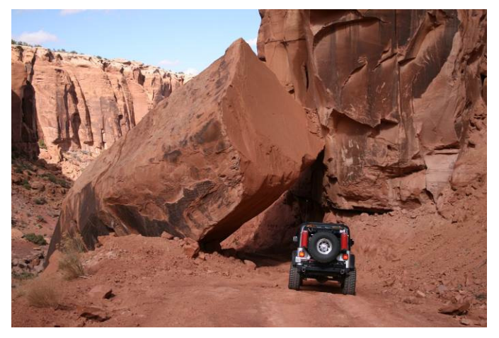
Friday April 12: Bartlett Wash and Hidden Canyon Wash, Mashed Potato

This is an easy trail that goes through a narrow section called Pucker Pass and under a large rock that's leaning over the trail.