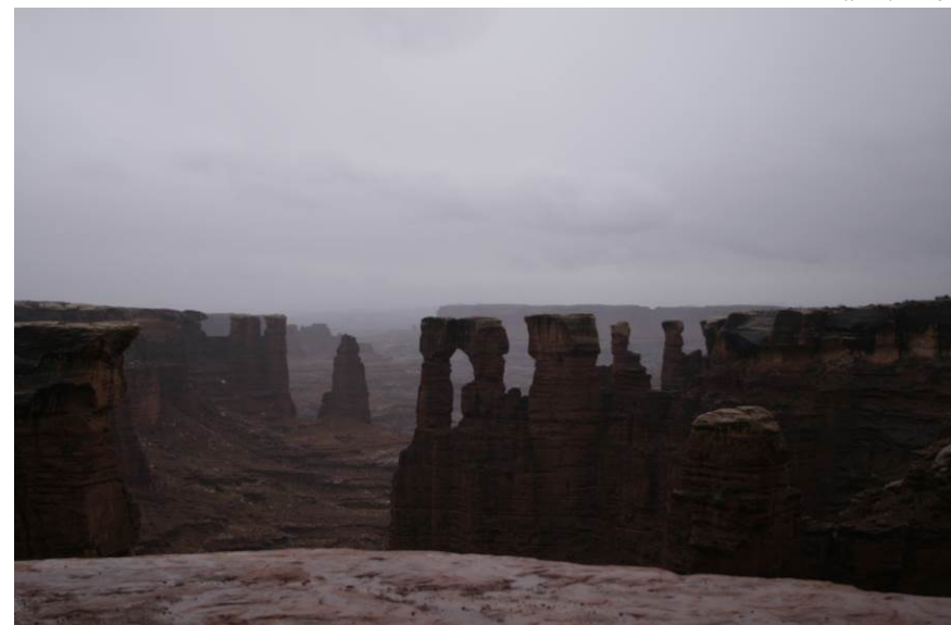
Leaving white rim trail is much like Shaffer Trail: a steep narrow cliff hugging trail

The trails then goes through Potato Bottom Campground where we stopped for lunch. We then climbed through shale type geography of Hardscrabble Hill a few hundred feet above the green river. If this trail is not maintained well it could be very spooky. Ray K had ordered a tractor to smooth out the trail ahead of our arrival.