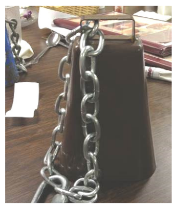
3 new brown bell

The cow bell rules are: If you get stuck and are unable to move under your own power and need the help of a winch or you get strapped from one of your fellow jeepers then you have earned the privilege of hanging a cow bell from your front bumper. You must leave the cow bell on the front of your rig until another Dirt Devil gets stuck then, you can proudly hand it over.